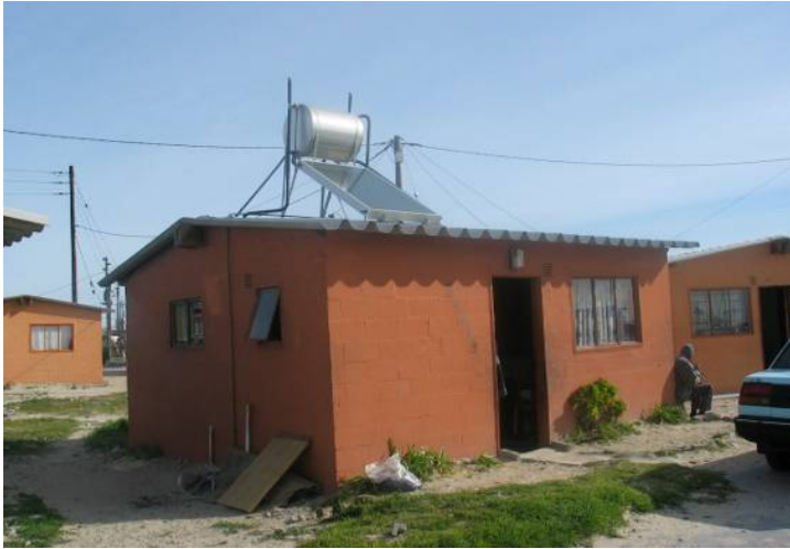
Figure 3.3 Social housing with subsidised solar water heater