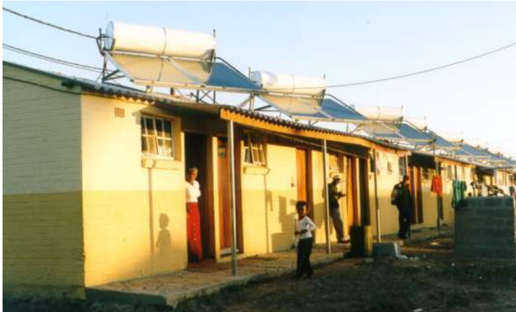
Figure 3.2 Solar water heaters on family units of a social housing complex near Cape Town